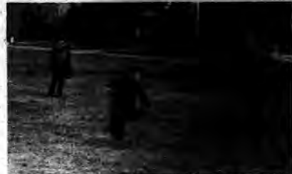
HICKSVILLE BASEBALL ASSOCIATION holds Major Little League Tryouts: In Spring a young man's fancy turns to - of all things - baseball! The boys are hoping to make a major league team this year and put out 100 per cent effort, in spite of the cool weather. "The talent looks great.. Williamsport here we come!" stated a spokesman for the Association.