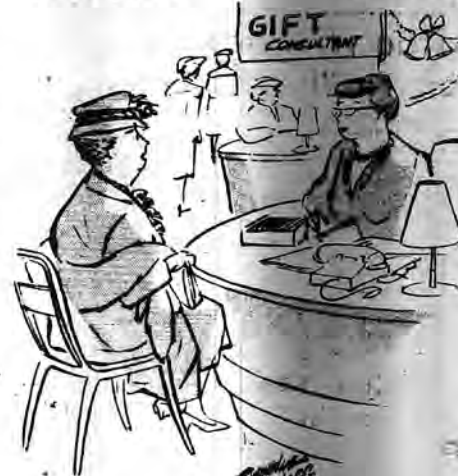
"He wants Jayne Mansfield, if that will be of any help."