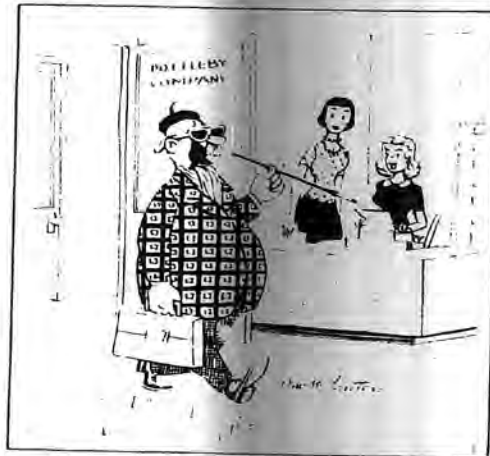
"Mr. Pottleby's been like that ever since the stockholders' meeting was televised!"

adding subdivision 26 to read as follows: NO STOPPING BUS STOP.