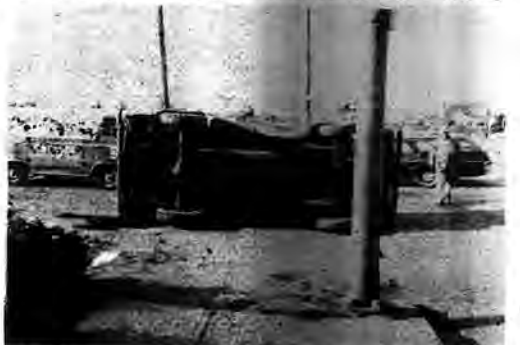
BOTTOMS UP: Nassau County Eighth Precinct Police and the Hicksville Fire Dept. Chemical Division both answered within minutes, this Monday a.m. when a Sears truck, involved in an accident, overturned on New South Road near Old Country Road.