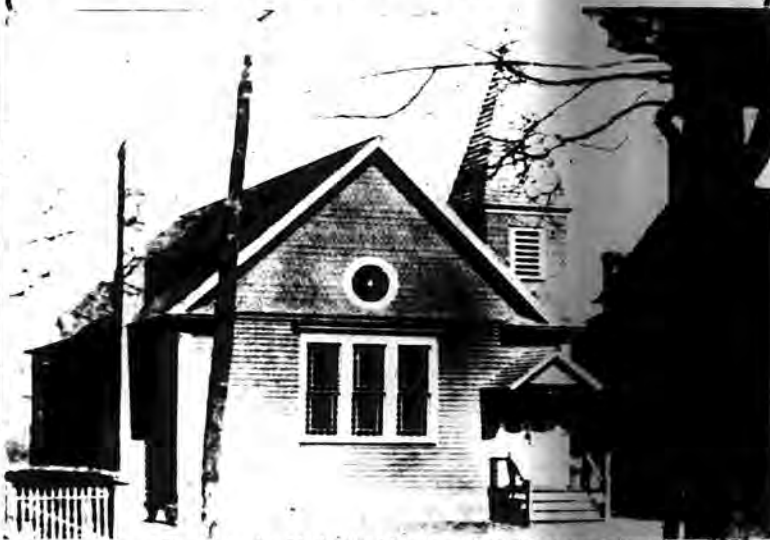
This picture of The Hicksville Methodist Church on Broadway was taken about 1900.