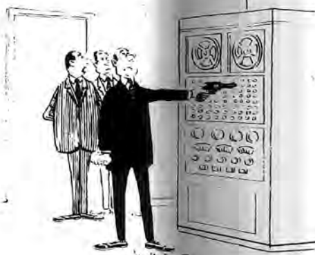
"It broke its transistor."

270 ft. S o Burton Ave. 751. WEST HEMPSTEAD - Dominick J. & Joan Ciervo, maintain addition to existing two family dwelling, E s Sycamore St. 320 ft. N o Fairlawn Ave. 752. FRANKLINSQUARE-Hill Homes, Inc., variance in required lot area & front width of lot to construct one family dwelling with one car garage, side yard stoop encroachment, S W side Polk St. 100 ft. N W of Lincoln Ave. 753. FRANKLIN SQUARE - Hill Homes, Inc., side yard variance with stoop & Chimney en- croachments, variance in required lot area & front width of lot to maintain one family dwelling, SW side Polk St. 55 ft. N W of Lincoln Ave. 754. ELMONT - Lawrence La Calandra, construct building to be used for office storage of contractors equipment, E s Meacham Ave. 54 ft. S o "D" St. 755. ELMONT - Lawrence La Calandra, waive off-street parking for proposed building to be used for office & storage of contractors equipment, E s Meacham Ave. 54 ft. S o "D" St. Interested parties should appear at the above time and place. By order of the Board of Zoning Appeals.