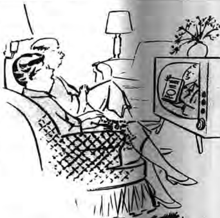
"It's getting so television is like spending the evening watching somebody empty your kitchen cabinets."

THE FOLLOWING CASES WILL BE CALLED AT 2:00 P.M.