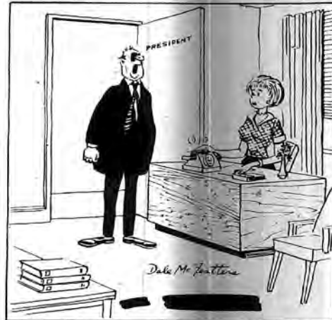
"Get me the plant psychiatrist who cured Argyle of his inferiority complex!"

width of lot to construct one family dwelling with garage. S-s Southern Parkway 370.86 ft. E-o Davis Ave.