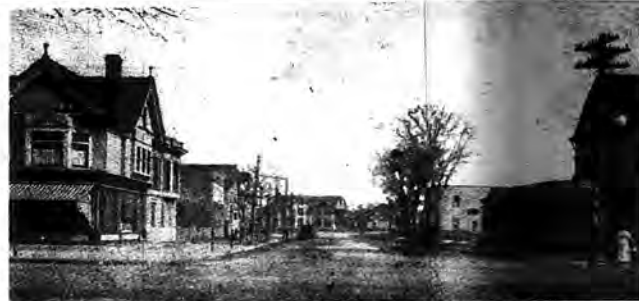
MARY ST. EAST FROM BROADWAY, HICKSVILLE, L.I.