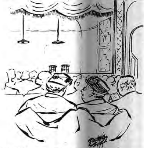
"I think it's one of those intellectual things. You know, you're supposed to like it whether you like it or not."

issued by the Board attesting to the qualifications for the applicant for the class of license specified thereon.