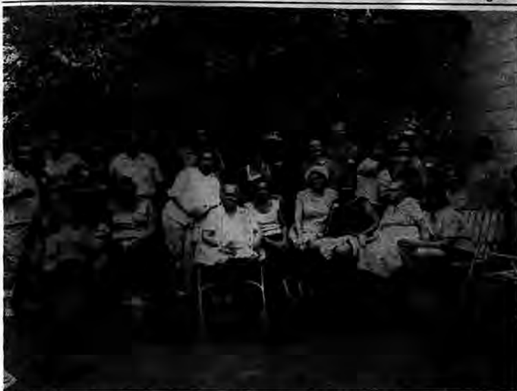
"GETTING TO KNOW YOU": Feeling that persons of different cultures ought to get to know each other underfriendly rather than crisis conditions, 50 parishioners of St. Ignatius Catholic Church, Hicksville, played host to 50 members of the Puerto Rican community of St. Rita's parish, South Bronx, at a softball game, cook-out, swim-