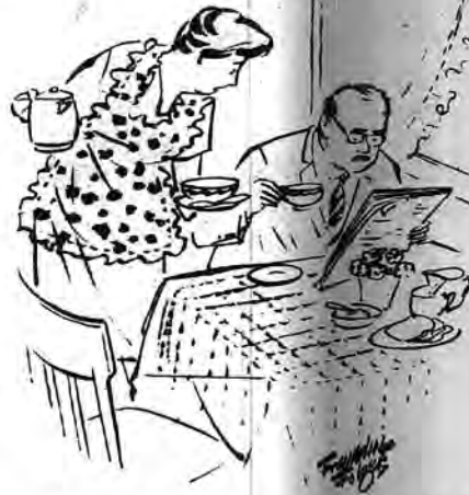
"Well, that's that! You've just eaten the cereal that cheers you up."