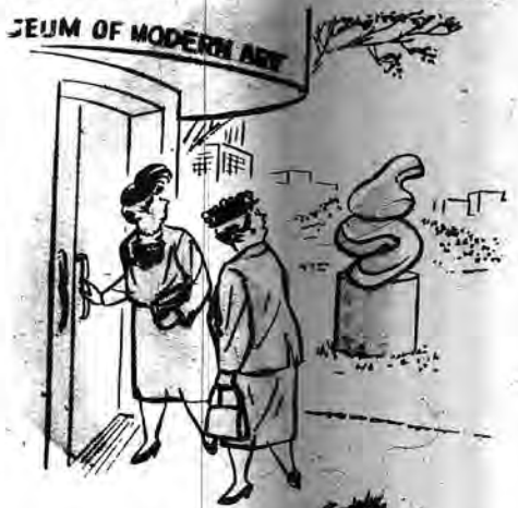
"Oh, dear, we're not even inside yet and I'm beginning to feel dumb!"