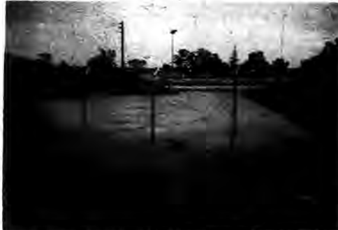
A NEW WIRE FENCE WAS ERECTED on the Merry Lane perimeter of Floyd's parking lot last week and a general cleanup of the area was also begun by Floyd's management. This action, though long-awaited, is sincerely appreciated by the residents of Birchwood. The Villager first brought the generally rundown condition of the fence and area to the community's attention in its July 11, 1968 edition, replete with a large photo. Subsequently, another photo and article appeared in later issues, pointing up the dismal appearance of the area.