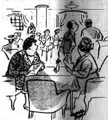
"I wish we had THEM for traffic officers. They'd NEVER see you go through a light!"