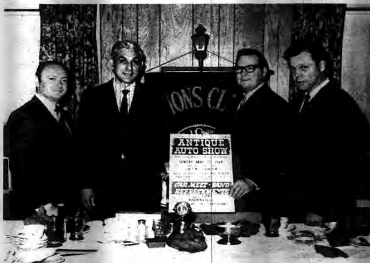
THREE LIONS CLUBS join in a fund raising project, an antique Auto show to be held May 25, at Mid Island Plaza, Hicksville. The Clubs of Northport-Centerport, Syosset and Hicksville invite one and all to join the fun and view over 100