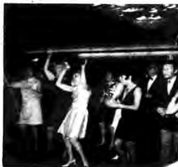
SCENES AT B.C.A. ELECTION DANCE

Calendar, Organizational and Community News - WE 8-1965 Insertion Deadline: - Sunday Noon - Material Can Be Dropped At Editor's Residence - 13 Millpond Street, Jericho. WE 8- 1965