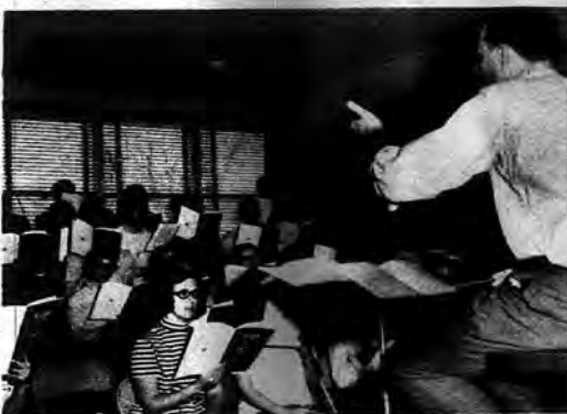
SPRING CONCERT AT H.H.S. The Hicksville High School music department presents its annual spring concert on Friday, April 25th 1969. The concert will be given in the senior high school auditorium at 8:00 p.m. The public is invited and admission is free.

This is an informative, interesting explanation of the budget and our school system. We suggest that you take advantage of this opportunity to learn more about your school district.