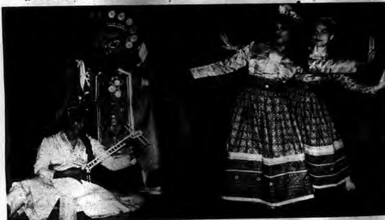
Oriental Folk Dances at Willet Ave. School: The Blue Peacock Players, dancers who specialize in Oriental folk dances, performed recently at the