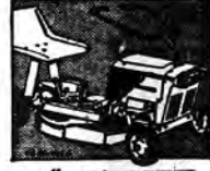
24" DELUXE RIDER