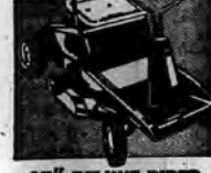
25" DELUXE RIDER