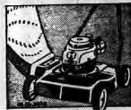
16" ROTARY MOWER