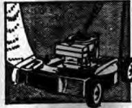
16" DELUXE ROTARY