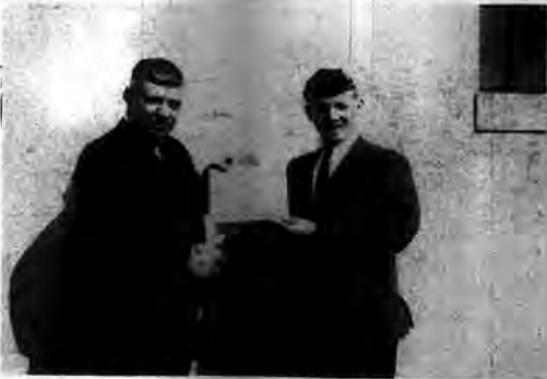
POST OFFICE HONORS AMERICAN LEGION: The United States Post Office cognizant of the American Legion's 50th Anniversary, issued a new 6 cent postage stamp, commemorating the historic event.

The new red, white and blue stamp went on sale to the general public at the Hicksville Post Office on March 17th.