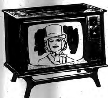
LEFT: THE STAR CROSS Special Price-