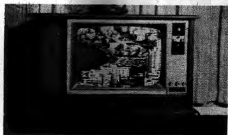
MODEL 54M 124