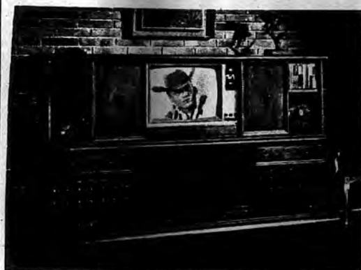
PICTURED ABOVE: THE MALAGUENA

86" Long-Mediterranean Style-Pecan Wood Bookcase- Color TV w/ Automatic Fine Tuning-A.M.-F.M. Stereo Radio-Stereo Phono w/record storage. SPECIAL SALE PRICE...$1300*