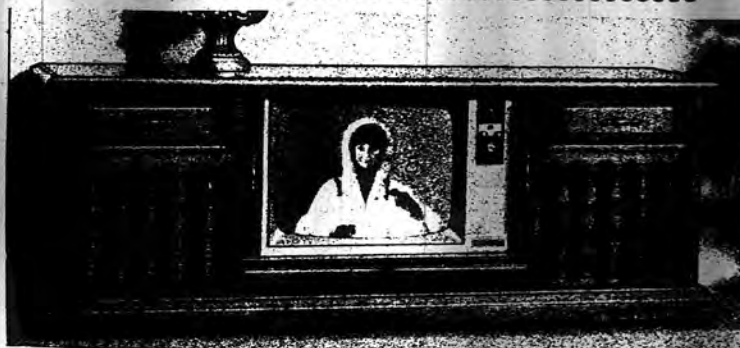
ABOVE: 72" WIDE GENUINE PECAN Home Entertainment

86" Long-Mediterranean Style-Pecan Wood Bookcase- Color TV w/ Automatic Fine Tuning-A.M.-F.M. Stereo Radio-Stereo Phono w/record storage. SPECIAL SALE PRICE...$1300*