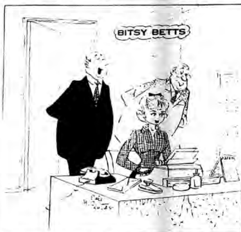
"She's good at typing but P-O-O-R in spelling."