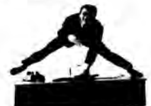
See the Minute Man for money in a minute.

Drop into one of our 90 convenient offices, or if you're tied up, use our Phone-A-Loan service. Our wires are open until 5 p.m. every weekday. And now you can apply for loans on Saturdays from 9:30 to 12:30 at 40 Auto Tellers.