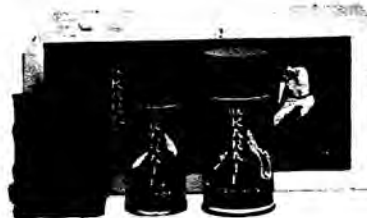
GIFT SET OF COLOGNE/SOAP/ SHAVING CREAM ($5.50)