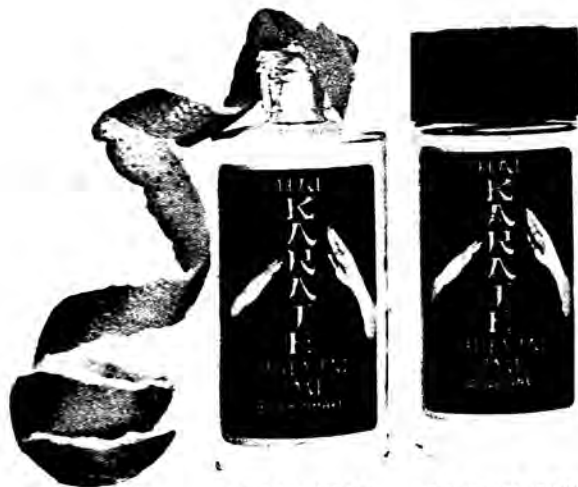
AFTER SHAVE LOTION (1.75)