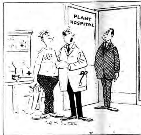
"The plant manager stabbed him pinning on a safety medal."