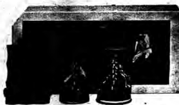
GIFT SET OF COLOGNE/SOAP/ SHAVING CREAM ($5.50)