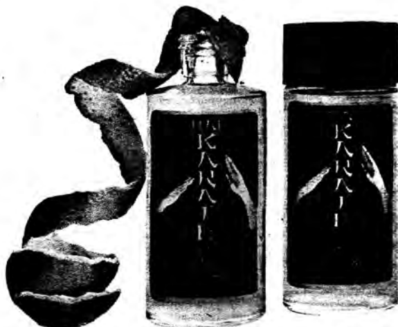
AFTER SHAVE LOTION (1.75)