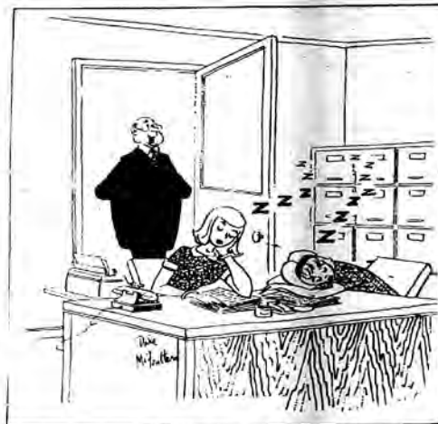
"Have you finished proof-reading my speech?"