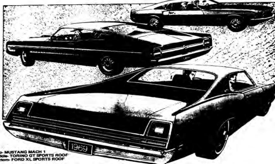
Top- MUSTANG MACH 1 Middle- TORINO GT SPORTS ROOF Bottom- FORD XL SPORTS ROOF

You've Got To Go See What's Going On- Your Ford Dealer BOB-KEN FORD!