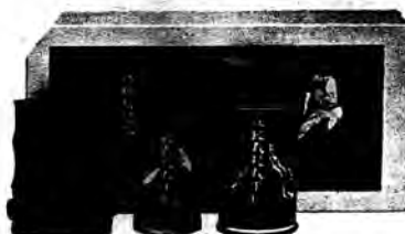
GIFT SET OF COLOGNE/ SOAP/ SHAVING CREAM ($5.50)