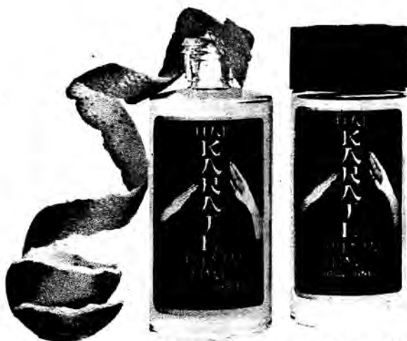
AFTER SHAVE LOTION (1.75)