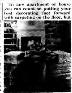
Ottomans with overcoats

Don't let the skeleton in your apartment be a misplaced closet or an awkward niche. Remove the door and hardware and run a bar of light inside. Make magic by running the same carpet from the adjacent room right into the closet to create a total look. Here, for example, the walls and shelves are covered with silver vinyl to give the glasses and accessories a wonderful shimmer quality. A painted cabinet mounted at serving height doubles as counter and storage space (left).