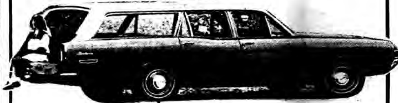
FAIRLANE STATION WAGON