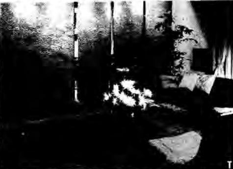
Carpet, carpet on the wall

If your budget floors you, and you cannot cover your