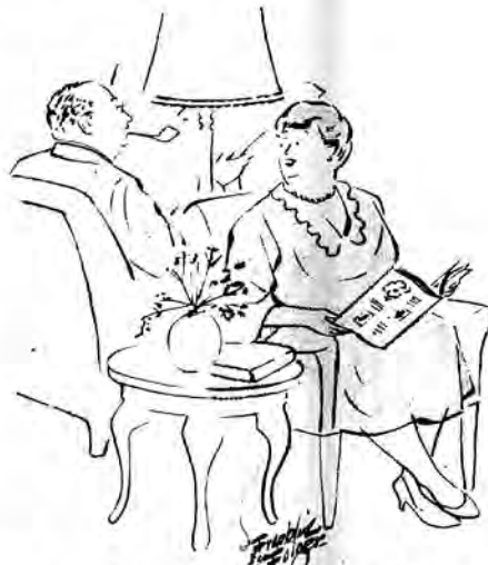
"One nice thing about seed catalogs - you at least get to see how the things you planted last spring WOULD have looked."