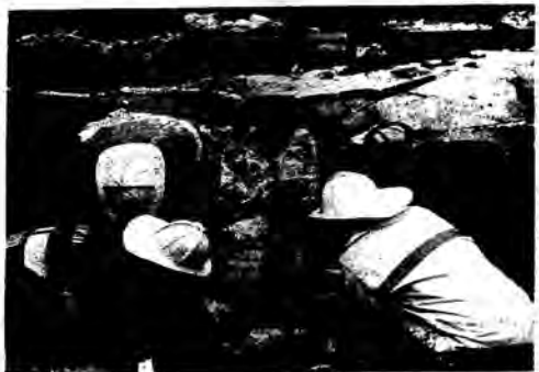
LIGHTNING STRUCK, TWICE! Not lightning, but a disastrous fire took its toll, twice in the same place, yesterday afternoon at 2:45 when the use of acetylene torches caused another fire in the former Country Corner Restaurant, located at the intersection of South Oyster Bay Road and Plainview