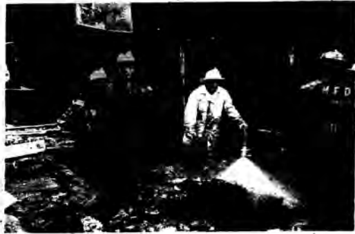
Road in the Hills Shopping Center. The first fire occurred several months ago. As usual, prompt and efficient action of our HICKSVILLE FIRE DEPARTMENT, kept further damage to a minimum.