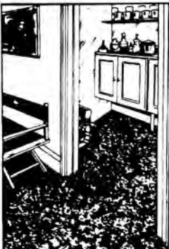
Bar-gain, a carpeted closet

walls follow the footsteps of an inspired bride in her first small apartment. Use substantially sized plywood cubes with foam