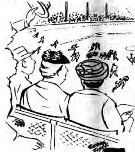
"I had no idea it was so much like football!"