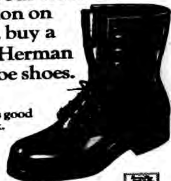
STEEL SAFETY TOE

When your feet need protection on the job, buy a pair of Herman safety toe shoes.