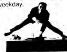
See the Minute Man for money in a minute

Drop into one of our 90 convenient offices, or if you're all tied up, use our Phone-A-Loan service. Our wires are open until 5 p.m. every weekday.