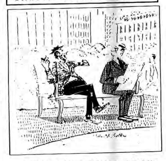
"I didn't even get my foot on the first rung of the ladder