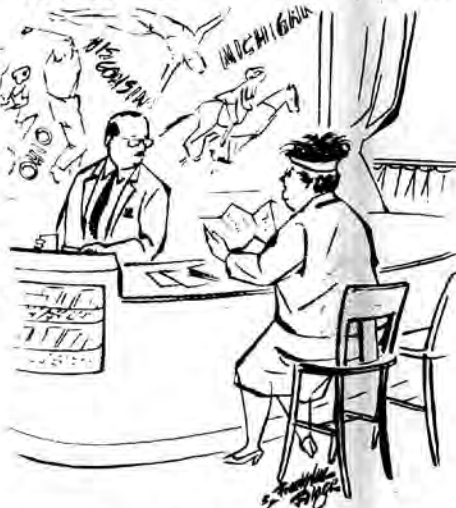
Of course, when I say I want to get completely away from civilization, I mean with a bathroom.