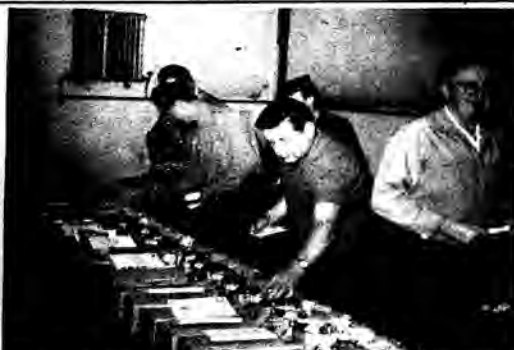
Members of the William M. Gouse Jr. Post No. 3211, Hicksville, Veterans of Foreign Wars assembling packages to send to young men of Hicksville serving in Vietnam. The organization mails approximately 40 packages each month.

Any questions or information about the program can be had by contacting the chairman at Wells 5-6817.