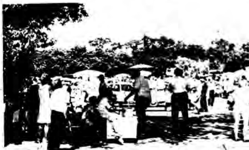
Our Staff Photographer was requested to cover the antique display at C. W. Post College, Old Brookville, last Sunday. Naturally, he believes a picture is worth a thousand words and turned in nothing but his photo which shows there was a large attendance. One of this paper's reporters found out that The Antique Show was sponsored by The Women's Auxiliary of The Samaritan Halfway Society of Astoria, a Narcotics Addiction Rehabilitation Center.