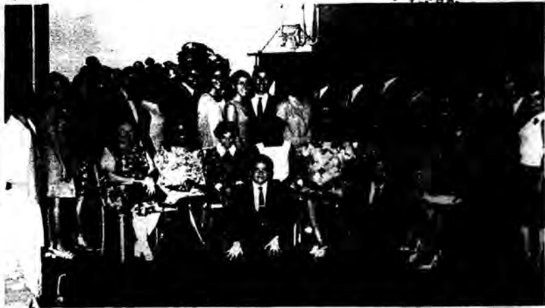
PUERTO RICAN STUDENTS and chaperons were the guests of the Hicksville Kiwanis Club, at a recent meeting.