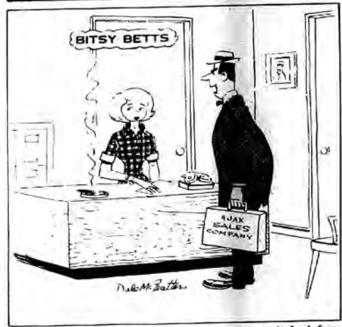
"Well, if your boss isn't in I presume you switched from cigarettes to cigars."