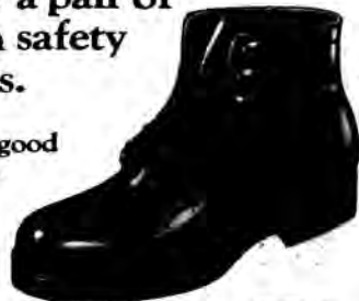
STEEL SAFETY TOE