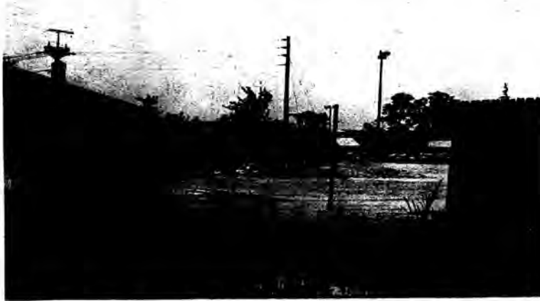
PERENNIAL EYESORE: This Photo shows the present condition of the fence on Merry Lane enclosing the rear of Floyd's parking lot. This condition has existed for a number of years, but the appearance of the fence area has never presented such a tumbled-down sight as it does now. The original fence was torn down by youthful vandals, and was replaced by management; then torn down and replaced again. However, at that point, the former management declined to do any more repairs. We hope the new management of Floyd's will see its way clear to eliminate this eyesore and refurbish the fence.