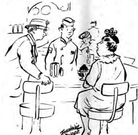
"I asked for a pot of tea, not a chocolate fudge sundae. Oh, hello Doctor."