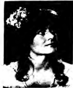
VANESSA REDGRAVE stars as Queen Guenevere in Warner Bros.' "Camelot," produced by Jack L. Warner and directed in Technicolor and Panavision by Joshua Logan from the Alan Jay Lerner-Fredrick Loewe musical romance. The spectacular film, which also stars Richard Harris and Franco Nero, opens on Wednesday evening, June 19, on an Exclusive Reserved Seat Engagement at the Lynbrook Theatre.

"All Mothers are urged to attend this program. Remember this is for your safety and that of your children," said a spokesman for this active group.