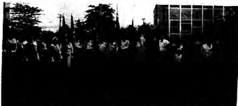
"BACK TO GOD" MOVEMENT: Approximately 150 members and friends attended the Charles Wagner Post #421 American Legion's "Back To God Movement" held on Sunday May 26th at Our Lady of Mercy R.C. Church. Above is a photograph of some of those present. The next date will be Sunday November 10th at a church still to be determined. The committee appreciates the cooperation it received and sincerely hopes that it will continue.