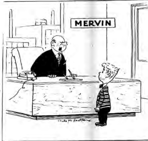
"What's this about you selling popcorn at the Safety Films for Supervisors?"