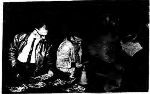
INTERESTED REPRESENTATIVES of 20 organizations looked over pictures of the Hicksville Tercentennial Celebration parade of 1948, loaned by the HERALD, at a meeting held Mar. 21 to plan a motorcade set for May 23. At least 14 float entries were received and more are expected. Another meeting in May is scheduled to finalize plans.