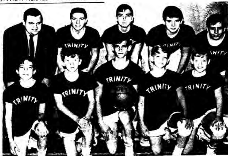
TRINITY OF HICKSVILLE defeated Gloria Del of New Hyde Park 66 to 54 in a playoff for third place in the Junior division of the Nassau - Suffolk Lutheran Church Basketball League. Trinity finished the season with a 14-2 record, losing twice to the Junior Division League champions, St. Peter's of Huntington, by one and three points respectively.

April 24, 1767 - Thomas Gainsborough's "The Prince of Parthia" was shown at the Southwick theatre in Philadelphia, probably the first American play professionally presented.