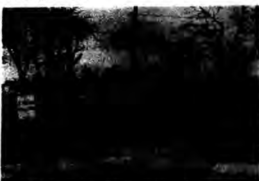
TAXI CAB parking area at Jerusalem Ave. and Marie St., Hicksville, is considered an eye sore by the neighborhood. Used cabs are reportedly held for resale to Southern operators and town officials have promised to close down on the operation of used car lots without town board permission.

The company operates a loop between Lynbrook, Baldwin and Hempstead, direct routes between Freeport - Hempstead - Mineola, between Hempstead and Hicksville, one via East Meadow and a second via Meadowbrook Hospital, between Hempstead and East Meadow with a loop to East Meadow and a spur to Hempstead and another between East Meadow and Hicksville with a loop within East Meadow and a spur to Hicksville. These fares will range between 30 cents and 50 cents, depending on the distance traveled.