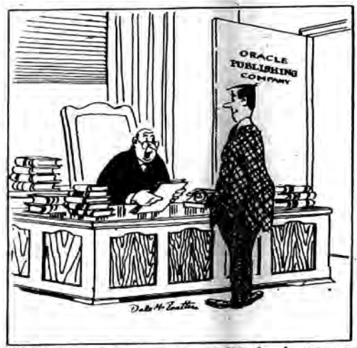
"You have good potential as a nevelist, Argyle, once you get over the habit of starting every story, 'Once upon a time . . .

Cann, front yard average set-back variance to construct ad-dition with caves encrochment to one-family dwelling, E/s Valley Bd. 444.08 ft. S/o Church