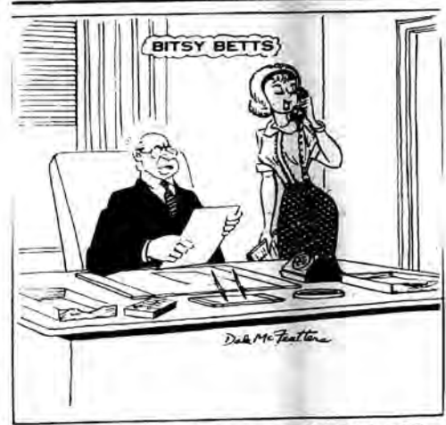
"Yes, he's here - steaming over a letter I typed."