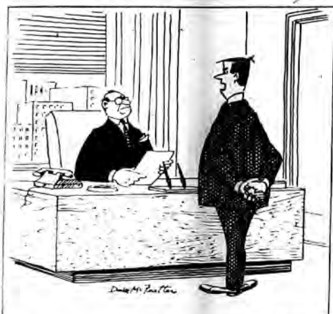
"That's not very fair, Sir . . . promising me a raise whenever I MERIT one!"