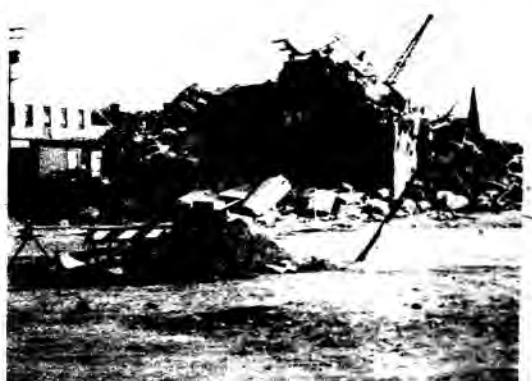
LI NATIONAL BANK was a pile of broken masonry this week and reminded some of a shattered Grecian temple. Herzog Pl. is in the foreground.