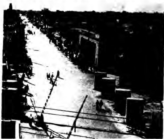
HOW IT WAS, looking at the same view of Broadway (see top) before the LIRR crossing was eliminated. Both pictures were taken from the same location on the roof of the four-story Professional Bldg.

Some concerned individuals have awaited patiently for the Chamber of Commerce to follow thru on the initial spurt of leadership displayed when plans for the widening of Broadway, a state highway, first were confirmed.