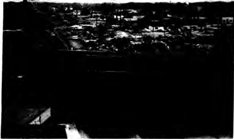
WEDNESDAY OF THIS WEEK view of Broadway west side, looking south. St. Ignatius Church steeple is only familiar landmark remaining on skyline. See below.