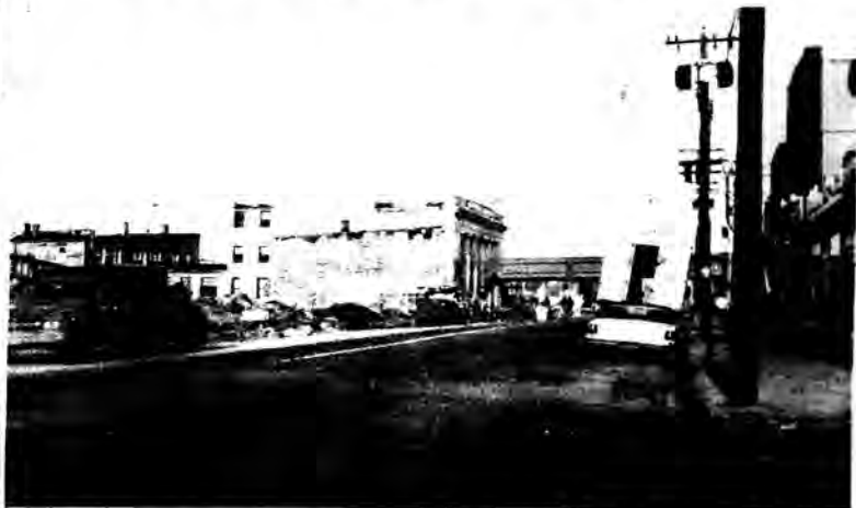
WEST SIDE OF BWAY, Hicksville, is barren of buildings from the LIRR south to Old Country Rd. with the exception of the LI National Bank Bldg. Contractor has prohibited parking along most of the east side of Broadway with temporary signs hung on parking meters. This was the view yesterday (Wed) morning from Mar 16 St. corner, looking north.

The Director of the Nassau County Planning Commission has taken issue with recent published reports that plans have been shelved for the development of Hicksville as a major transportation hub.