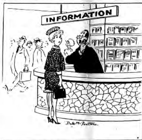
"Yes, Madam, it's showing."