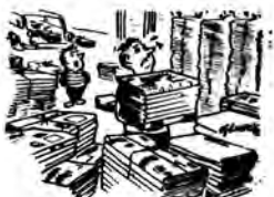
"Hold it pop—the scouts have decided to sell candy bars instead..."

Accomplished? A past year of splendid achievement!