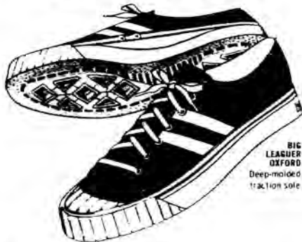
BIG LEAGUER OXFORD Deep-molded traction sole

The great outdoor shoe KEDS® BIG LEAGUER with longer wearing sole