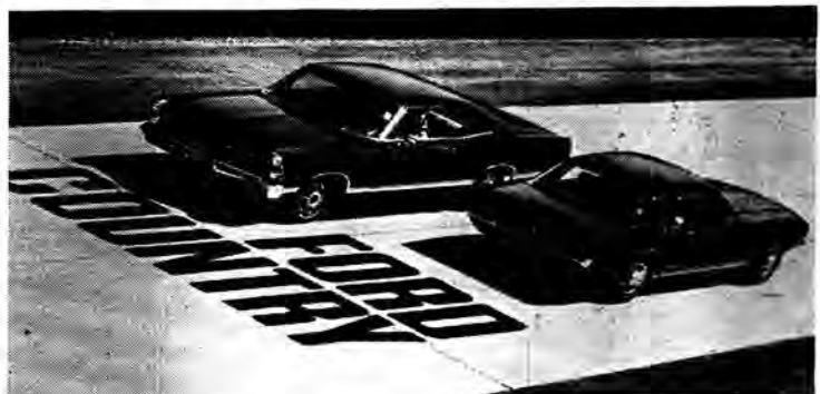
Ford Galaxie 500 and Mustang Hardtop