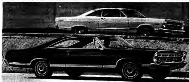
'67 Fairlane, top, with '67 Ford Galaxie 500 Hardtop. Big Ford prices start as low as $2440.78*

STORE HOURS: Mon.-Tues. 1:00 - 4:30 Wed. thru Sat. 10:00 - 4:30 Fri. Eve. 7:00 - 9:00