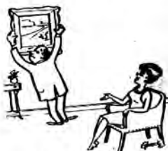
"Just hold it for a while. I want to see if I can live with it there."

The executive board of the Hicksville Council of P.T.A. Units will hold its meeting Wednesday May 10 in the library of the Hicksville Junior High School at 8:30 P.M. On the agenda are final committee reports.