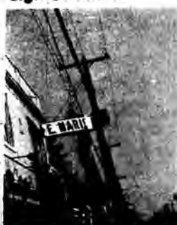
STREET SIGN at Broadway and Marie St. hangs limply and wrinkled, symbolic of the creeping deterioration of the business section.