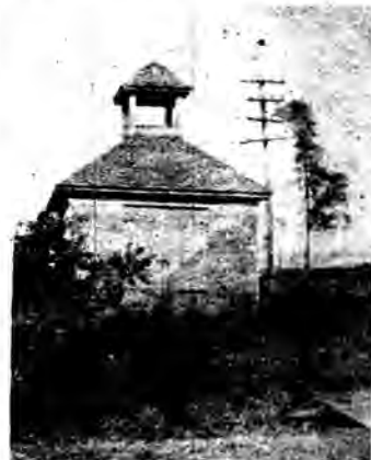
on the present day site of the main fire headquarters on E. Marke St at the LIRR crossing.

The picture at right represents the oldest available picture of a fire fighting station in Hicksville