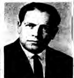
Candidate for School Bd.