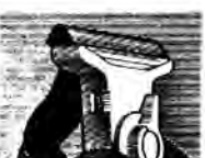
Leave longer time. After extra weeks of shaving, snap in a new 10-edge cartridge - you never touch a blade.

Schick Science brings you the new cartridge-loaded Schick Band Razor. Inside the cartridge, not just six, but ten Schick Super-Stainless Steel Edges coiled into one continuous shaving band.