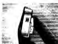
For a new shaving edge, just wind the lever on the cartridge. It's easy. Guide numbers are on the side.