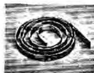
10 new edges, not just 6. The new Schick Super-Stainless Steel Edges on a continuous band.