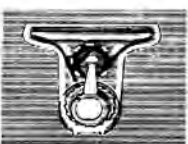
Patented slotted band. Band holds taut between two spools. Gives you the control and the comfort you want.