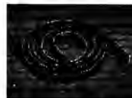
10 new edges, not just 6. Ten new Schick Super Stainless Steel Edges on a continuous band.