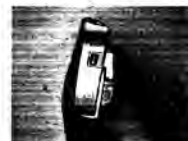
For a new shaving edge, just wind the lever on the cartridge. It's easy. Guide numbers are on the side.