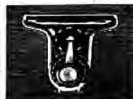
Patented slotted band. Band holds taut between two spools. Gives you the control and the comfort you want.