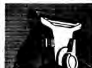
Leads longer time. After extra weeks of shaving, snap in a new 10-edge cartridge - you never touch a blade.

Schick Science brings you the new cartridge-loaded Schick Band Razor. Inside the cartridge, not just six, but ten Schick Super Stainless Steel Edges coiled into one continuous shaving band.