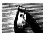
For a new shaving edge, just twist the lever on the cartridge. It's easy. Guide numbers are on the side.