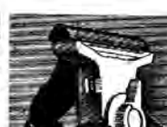
Leans longer top. After extra weeks of shaving, wrap in a new 10-edge cartridge -- you never touch a blade.

The patented Schick band is slotted. It feeds between two spools, holds each new edge taut to give you the control and the comfort you want. You'll like the convenience. You'll like the way each edge has the famous Super Krona coating to shave you closer -- with greater comfort.