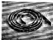
10 new edges, not just 6. Ten new Schick Super Stainless Steel Edges on a continuous band.