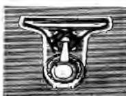
Patented slotted band. Band holds fast between two spools. Gives you the control and the comfort you want.