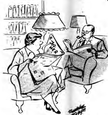
"Don't you just love the news these days!"

right to have an attor- ney-at-law appear for you.