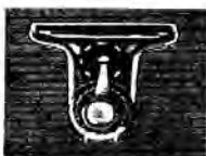
Patented slotted band. Band holds fast between two spools. Gives you the control and the comfort you want.