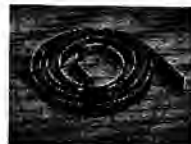
10 new edges, not just 6. Ten new Schick Super Stainless Steel Edges use a continuous band.