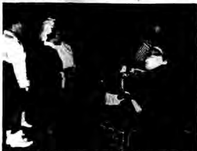
Santa and his helpers were on hand to wish everyone a Merry Christmas and of course to give the presents to each of the starry eyed children.

Hi! This week we'd like to tell our story in pictures. These shots were taken at the Christmas party we held for underprivileged children, at Malloy College.