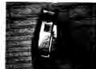
For a new shaving edge, just wind the lever on the cartridge. It's easy. Guide numbers are on the side.