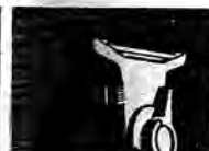
Lasts longer too. After extra weeks of shaving, snap in a new 10-edge cartridge - you never touch a blade.

Schick Science brings you the new cartridge-loaded Schick Band Razor. Inside the cartridge, not just six, but ten Schick Super Stainless Steel Edges coiled into one continuous shaving band.