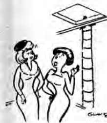
"Our guest room--"