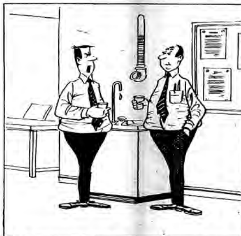
"If the government thinks we have a balance-of-payments problem they should meet my wife."

etery on Old Country Road in Hicksville on Tuesday January 31, 1967 at 10:00 a.m.