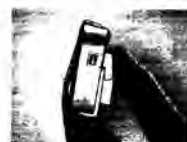
For a new shaving edge, just wind the lever on the cartridge. It's easy. Guide numbers are on the side.