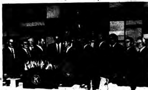
Honoring our high school football, soccer and cross-country championship teams

Scholarships ★ Thanksgiving Baskets ★ Kids Day ★ Children's Christmas Party ★ Children to Camp ★ Santa Claus Visit to Shut-Ins ★