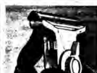
Lasts longer too. After extra weeks of shaving, snap in a new 10-edge cartridge - you never touch a blade.

Schick Science brings you the new cartridge-loaded Schick Band Razor. Inside the cartridge, not just six, but ten Schick Super Stainless Steel Edges coiled into one continuous shaving band.