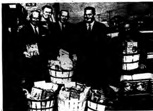
Preparing to spread Christmas cheer

Sponsor High School Key Club Beautify Hicksville Campaign