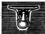
Patented slotted band. Band holds taut between two spools. Gives you the control and the comfort you want.