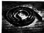
10 new edges, not just 6. Ten new Schick Super Stainless Steel Edges on a continuous band.