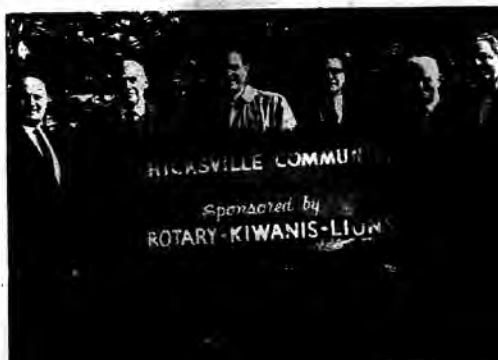
Co-sponsoring Community Christmas tree

Physical Fitness and Academic Improvement Awards