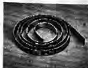
10 new edges, not just 6. Ten new Schick Super Stainless Steel Edges on a continuous band.