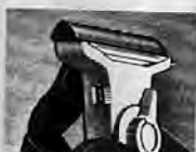
Lasts longer too. After extra weeks of shaving, snap in a new 10-edge cartridge - you never touch a blade.

Schick Science brings you the new cartridge-loaded Schick Band Razor. Inside the cartridge, not just six, but ten Schick Super Stainless Steel Edges coiled into one continuous shaving band.