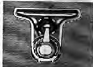
Patented slotted band. Band holds taut between two spools. Gives you the control and the comfort you want.