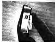
For a new shaving edge, just wind the lever on the cartridge. It's easy. Guide numbers are on the side.