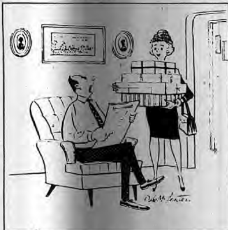
"There she comes! The secret weapon of the war on poverty!"

SUBJECT -- Variance to erect an addition having less front set- back, and less aggregate side yards than the Ordinance re- quires, together with the en- croachment of eave, gutter and stoop.