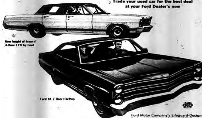
Ford XL 2 Door Hardtop

Trade your used car for the best deal at your Ford Dealer's now