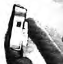
For a new shaping edge, just wind the lever on the cartridge. It's easy. Guide numbers are on the side.