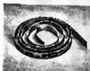
10 new edges, not just 6. Ten new Schick Super Stainless Steel Edges on a continuous band.