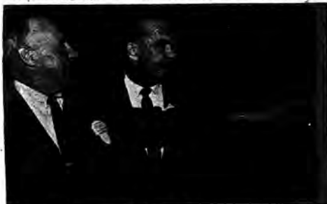
STATE SENATOR Henry M. Curran is shown water tables on a map of Long Island by Westbury Water Commissioner Joseph F. McKenna, legislative chairman of the Long Island Water Conference during a legislative dinner of the Conference, recently at Westbury, attended by 19 Nassau-Suffolk state legislators.

The eighth in the Plainview-Old Bethpage Public Library's 1966-1967 adult film showings will take place at the library on Friday evening, Dec. 16th at 9 P.M. "The Mouse That Roared" is a rare example of political satire in which Peter Sellers performs three major roles.