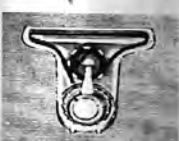
Patented slotted band. Band holds between two spools. Band holds control and the comfort you want.