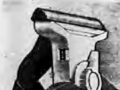
Lasts longer too. After extra weeks of shaving, snap in a new 10-edge cartridge - you never touch a blade.

Schick Science brings you the new cartridge-loaded Schick Band Razor. Inside the cartridge, not just six, but ten Schick Super Stainless Steel Edges coiled into one continuous shaving band.