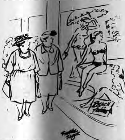
"You'll never catch me wearing anything like that just to attract some man's eye."