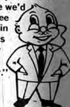
Mr. Meadow Brook

"And when you get your new car, please drive it safely. Because we'd like to see you again when it's time for your next car."