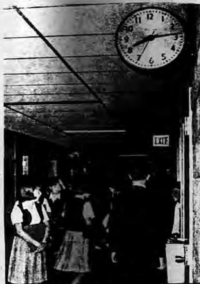
HISTORIC MOMENT in the corridor of the brand new Holy Trinity High School on Newbridge Rd., Hicksville, about a minute before the bell was to ring for the first time to signal the start of classes on opening day. Dedication of the school takes place on Sunday afternoon, Oct. 30.

As the result of the urging and efforts of the Supervisor an agreement has recently been concluded between the State of New York Department of Public Works and the Town of Oyster Bay under the terms of which the Town