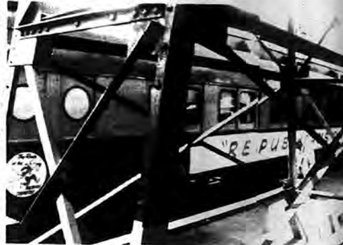
SPECIAL TRAIN carried dashing Long Island Republicans to Rochester for the state convention. This picture was taken from another train at Harmon, New York, at 1:20 P.M. on Sept. 6.