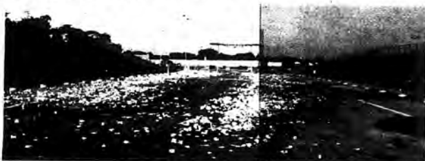
THIS WAS THE SCENE the morning after Labor Day and the 37th annual invitational volunteer firemen's drill which was won this year by St. James, breaking the long-running hold of Oyster Bay Rough Riders on the annual Hicksville competition. Thousands of drink containers littered the area between the grandstands in the area to the judging arch at Mid Island Plaza. It has since been cleared. (No. 1 of an occasional series).