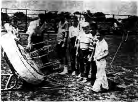
ARCHERY was one of the more popular activities of the Hicksville School District summer recreation program. Most of the arrows hit the target.