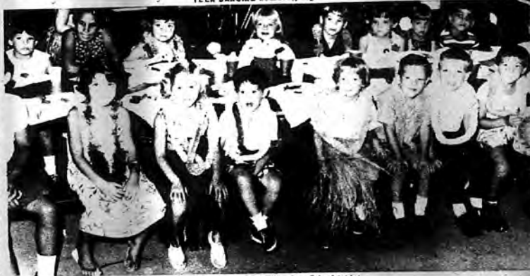
LUANA held at the Miller Ave. School last Sat.