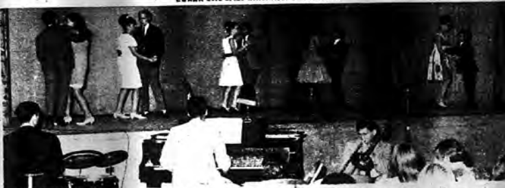
TEEN THEATRE production was "Thorber Carnival".