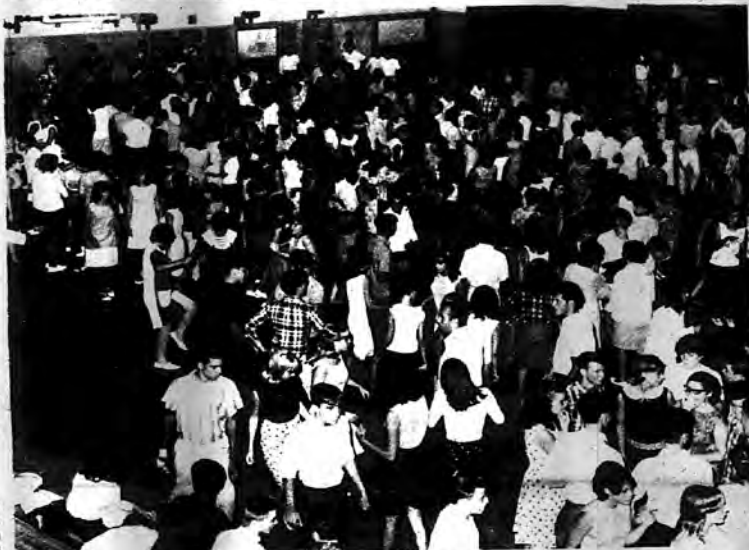
TEEN DANCING Wednesday night.

The State Traffic Commission has ordered that parking on both sides of the South Service Rd. of the LI Expressway from Rockland Dr. east for 200 feet be prohibited in Jericho. Stopping on the north side of Jericho Tpke between a point 550 feet west of Merry Lane and 100 feet west of the same Lane is prohibited.