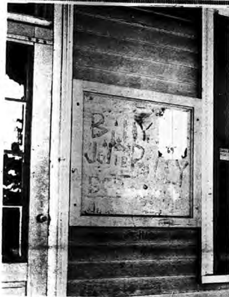
THE HISTORIC Hicksville Courthouse shows its 70 years of age with broken windows and lack of paint. Grounds around the building at Heitz Pl. and Bay Ave. were put in good condition during the week with wild, running shrubbery cut back and lawns trimmed.