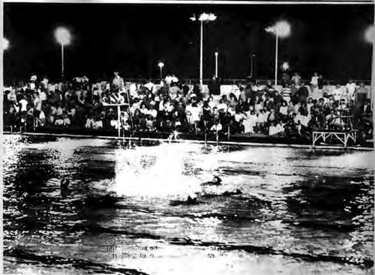
WATER BALLET was part of the official dedication program at the Cantigue County Park swimming pool in Hicksville last weekend.